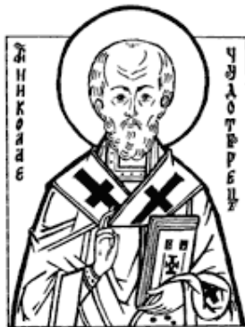
St. Nicholas - Bishop of Myra

At that time, Jesus was teaching in one of the synagogues on the Sabbath. And there was a woman who had had a spirit of infirmity for eighteen years; she was bent over and could not fully straighten herself. And when Jesus saw her, He called her and said to her, "Woman, you are freed from your infirmity." And He laid His hands upon her, and immediately she was made straight, and she praised God. But the ruler of the synagogue, indignant because Jesus had healed on the Sabbath, said to the people, "There are six days on which work ought to be done; come on those days and be healed, and not on the Sabbath day." Then the Lord answered him, "You hypocrite! Does not each of you on the Sabbath untie his ox or his ass from the manger, and lead it away to water it? And ought not this woman, a daughter of Abraham, whom Satan bound for eighteen years, be loosed from this bond on the Sabbath day?" As Jesus said this, all His adversaries were put to shame; and all the people rejoiced at all the glorious things that were done by Him.