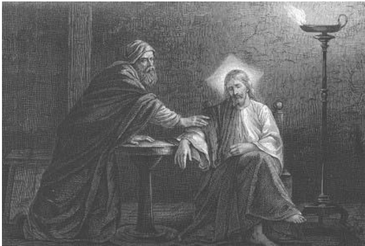
St. Nicodemus' secret visit to Jesus (John 3)

By the intercessions of the holy Myrrh-bearers, Joseph of Arimathea and Nicodemus, O God, have mercy on us. Amen.